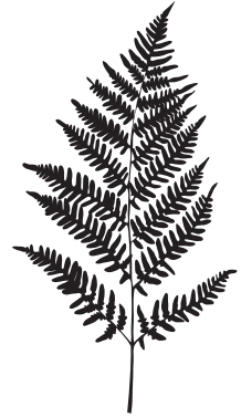
Fern stems x3