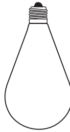
Celestial opal light bulb x10